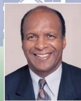
Jesse White Secretary of State

Printed on recycled paper. Printed by authority of the State of Illinois. October 2009 — 7.5M — VSD 717.2